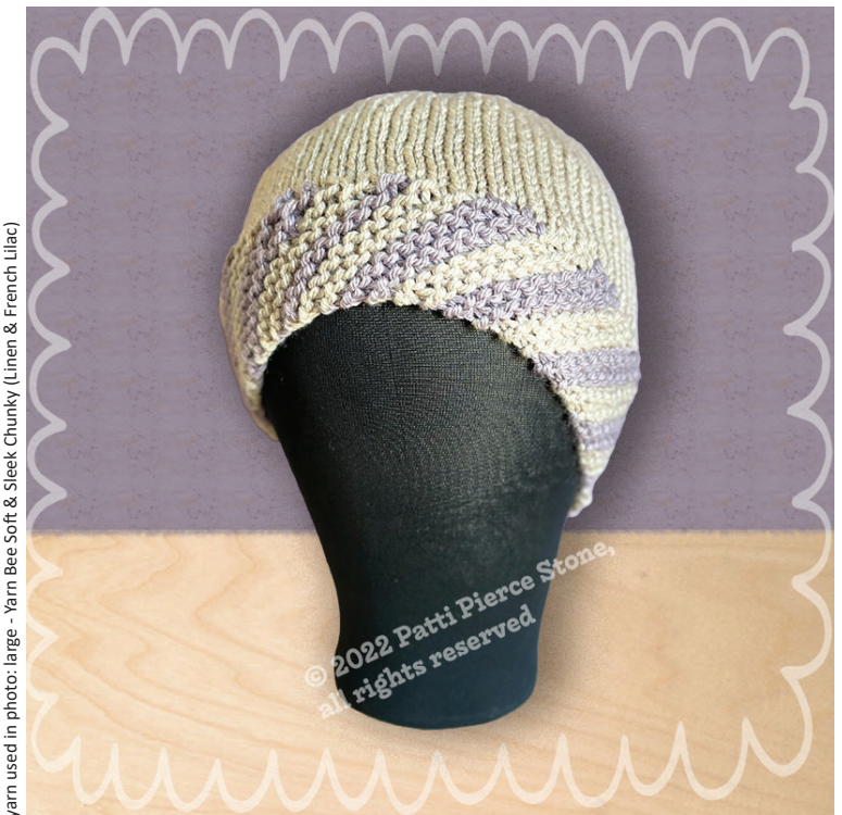
yarn used in photo: large - Yarn Bee Soft & Sleek Chunky (Linen & French Lilac)

Not a Kitchener fan? Use a third needle and join the two ends with a 3-needle bind off from the wrong side.